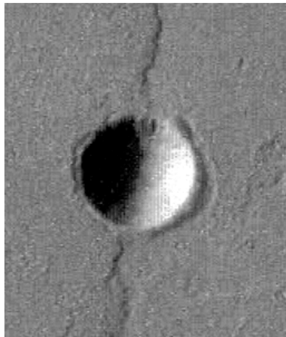
Figure 1. Mars Express HRSC image at 12.5 m/pixel shows a 1.4 km crater where lavas have overlapped most of ejecta blanket from W, flowing around the crater without breaching the rim. An older flow on E side appears to have done the same thing. The crater thus formed on an older, now-buried surface. Nearby HRSC examples explain why sharp-rimmed craters at D > 1.4 \text{ km} show older ages than isochron for smaller craters on top of the last flow.