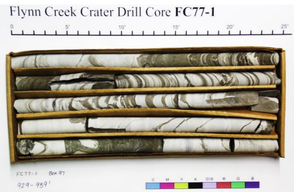
Figure 2. Example photograph of one of the 2,261 boxes of drill core from the Flynn Creek crater. Sample notes, scale bar, and color bar provided for identification and characterization purposes.

condition of core, original drilling notes (for three holes), general lithologic description, and geologic unit designation. In addition, photographic documentation procedures were developed and implemented to provide a more complete descriptive entry for each core box in the collection ( Figure 2 ); we have photographed ~500 boxes of core so far.